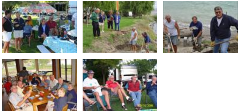
Doug Gibbs - January 27, 2023 at 10:58 PM

“ 5 files added to the album Memories Album